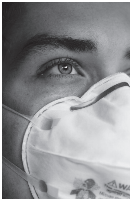
Photo: The University of Western is implementing COVID19 protocols this fall including masks and proof of vaccination. Officials say COVID is still prevalent and they want to ensure a positive in-school experience for their students.

The university, located in London, says face masks will also be compulsory in all classrooms and seminars.