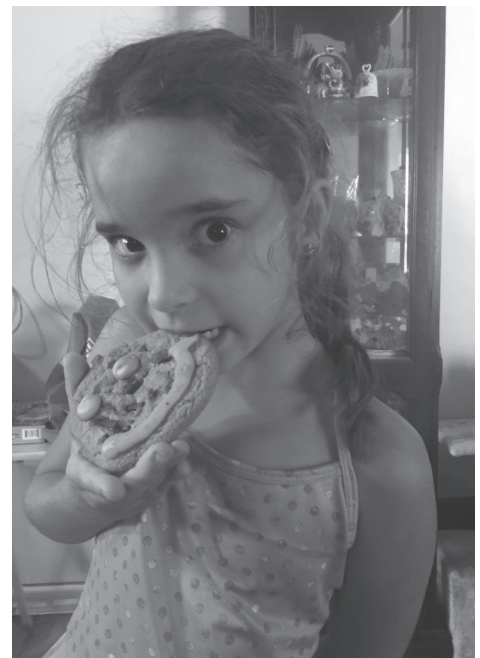
Photo: Kay Kay loves Smile cookies. It's time to get the gloves on and squeeze the frosting with volunteers needed to make literally hundreds of the delicious treats. Sign up and get set for the September marathon of frosting Smile Cookies.

If you are interested, please phone 705-869-5798 and they will try to fit a two-hour slot that suits volunteers. They start at 9:00 a.m. and end at 3:00 p.m.