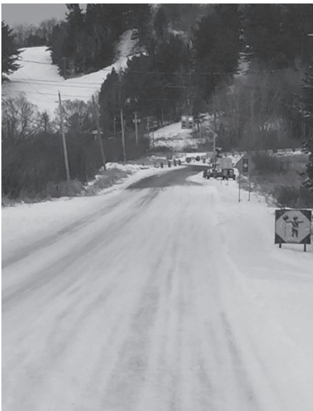
Photo: Construction of the new water main from Tank Hill to the Queensway Avenue started last fall and carried through to this year. Phase One is nearly complete with road reconstruction and property restoration now underway.

pipes. He says road reconstruction is now underway and is expected to be done by the time school begins.